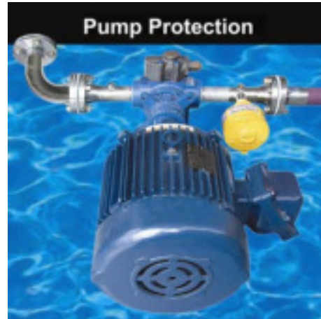
Fig 1. Pump with Flow Switch

Nothing can damage a liquid pump faster than the build-up of heat from dry running conditions, which occurs when liquid stops flowing into the line or the pump. When the liquid isn't there to provide cooling, the heat can destroy a pump's bearings. If repair is even possible, it is going to be a very expensive proposition.