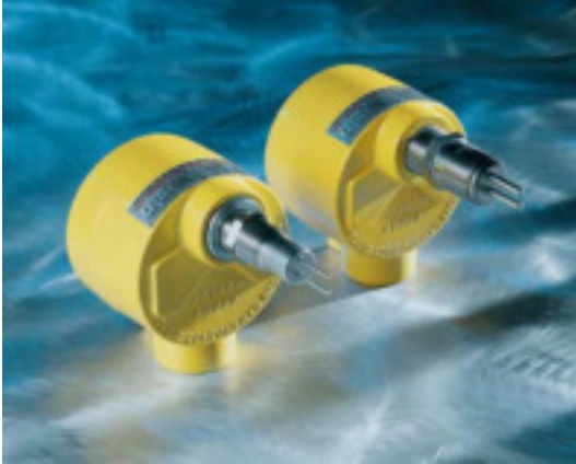
Fig 2. Flow Switch

Among the many types of point flow/level switches available is FCI's FlexSwitch® FLT Series, which offers dual alarm capability (Fig 2).